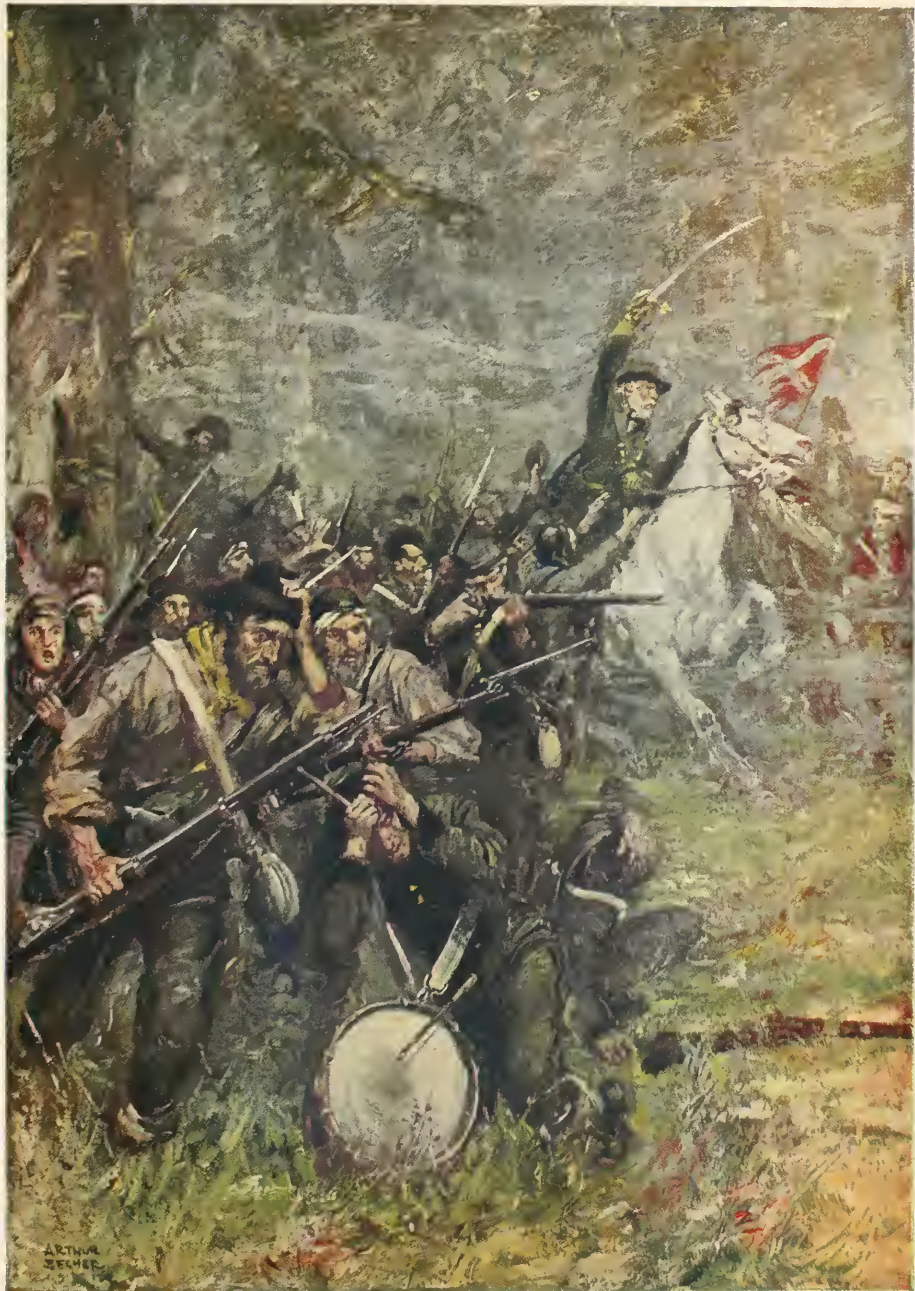
LEE RALLYING HIS TROOPS AT THE BATTLE OF THE WILDERNESS.